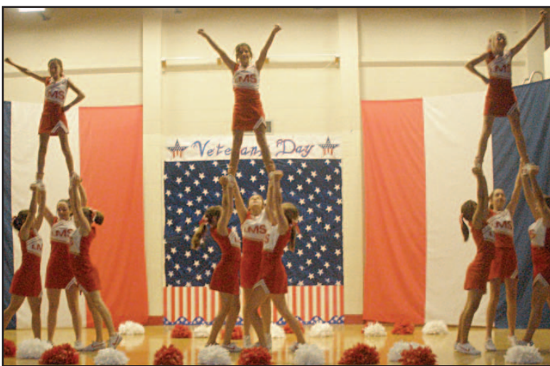
The Labadieville Cheerleaders got the audience excited with a dance to "R-O-C-K in the U.S.A."