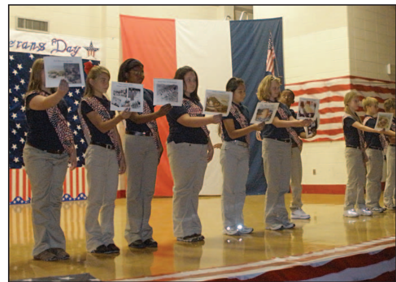
Fifth and sixth graders teamed up and performed a skit titled - "American Heritage".