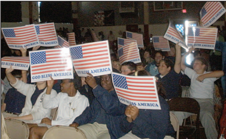
LMS students wave flags as they sing "God Bless The U.S.A."

Labadieville Middle School students, teachers and administrators celebrated Veterans Day on Monday and took time to remember those who made the ultimate sacrifice and thanked those who served and continue to serve this country in the armed forces.