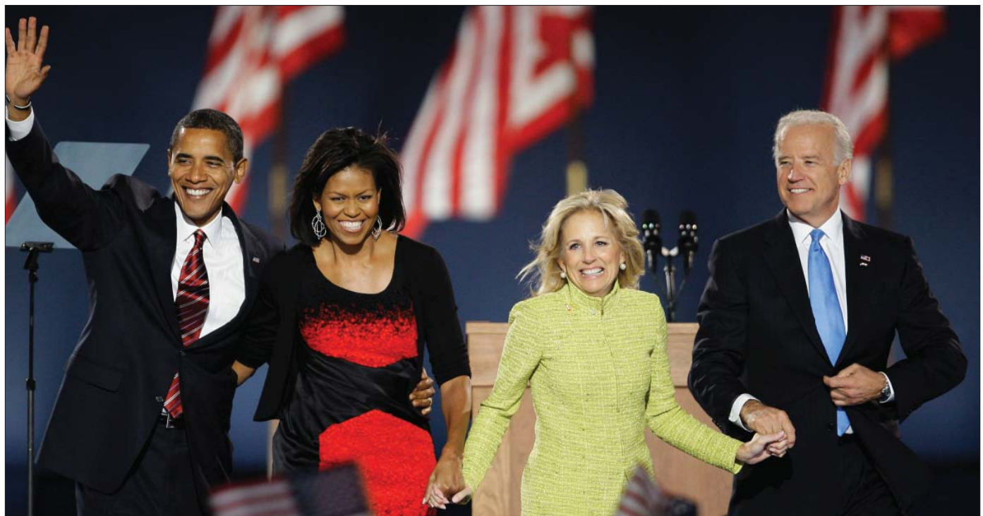
President-elect Barack Obama and his wife, Michelle, and Vice President-elect Joe Biden and his wife, Jill, wave to the crowd after Obama's acceptance speech at his election-night rally at Grant Park in Chicago.