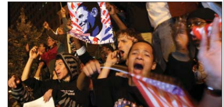
Supporters of President-elect Barack Obama cheer in the streets Tuesday in downtown Chicago.